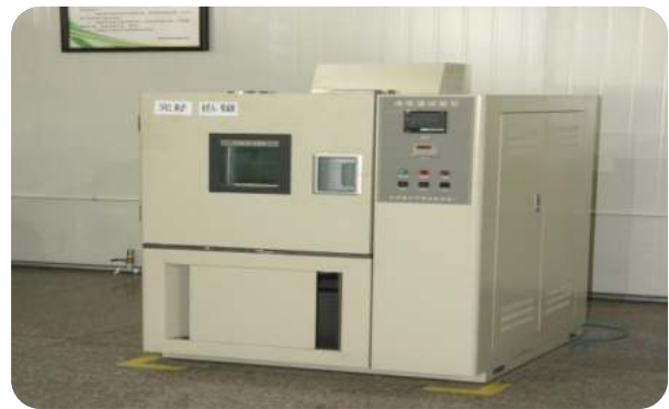
LOW&HIGH TEMPERATURE TESTER