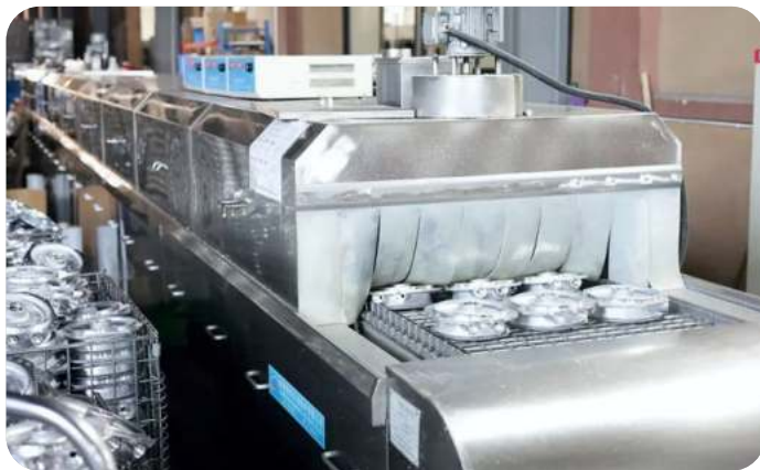
AUTOMATIC SURFACE TREATMENT LINE