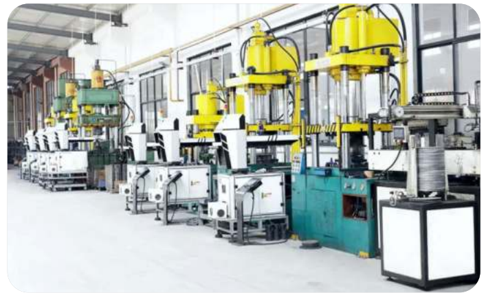
AUTOMATIC STAMPING LINE