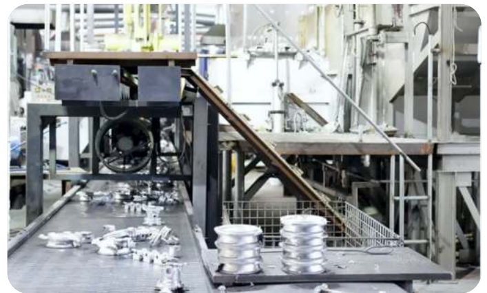
HIGHLY AUTOMATIC DIE CASTING PRODUCTION LINE