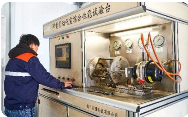
COMPREHENSIVE PERFORMANCE TESTER