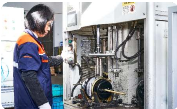
AIR LEAKAGE TESTER