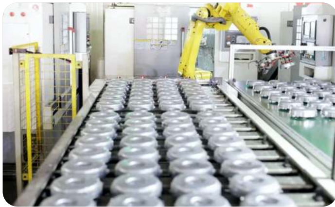
AUTOMATIC MACHINING LINE